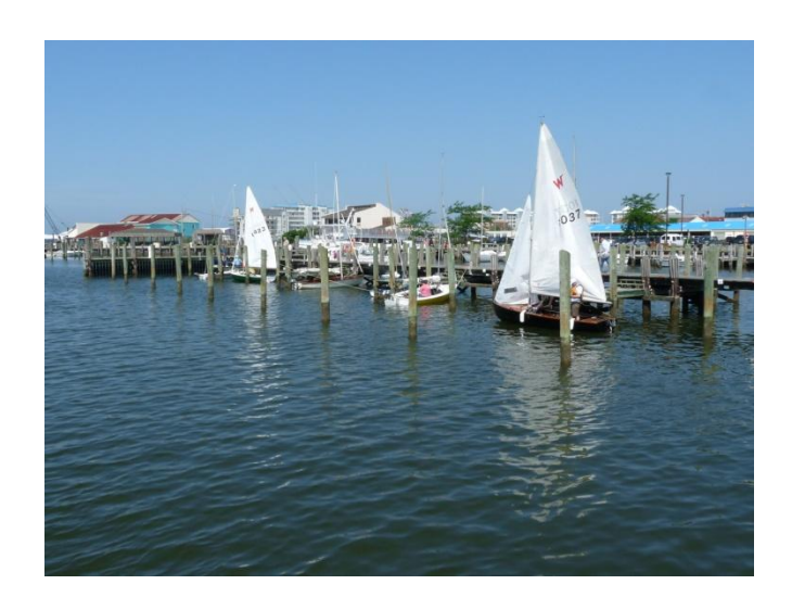
CHESSIE CRUISE AND ROCK HALL 2010