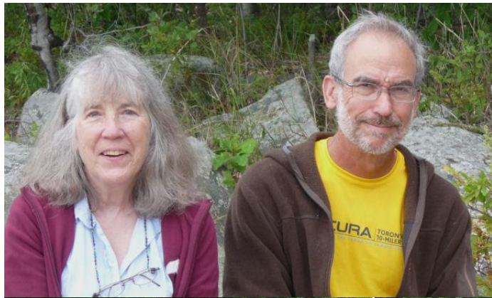
Rally at Killbear Park attracts first timers to the Wayfarer cruising scene. Some are pictured here.