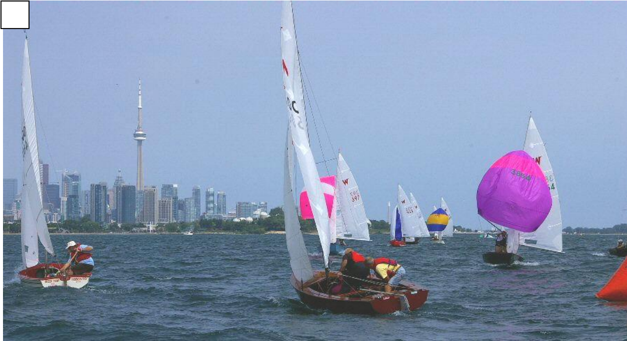
Wayfarers beat towards the Toronto skyline after rounding the leeward mark during Race 3 in the North American Championships at Toronto Sail and Canoe Club in July.