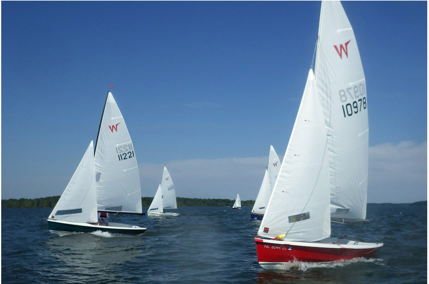
The fleet takes on the windward leg of the 62nd Governor's Cup on Kerr Lake, which straddles the state lines of Virginia and North Carolina.