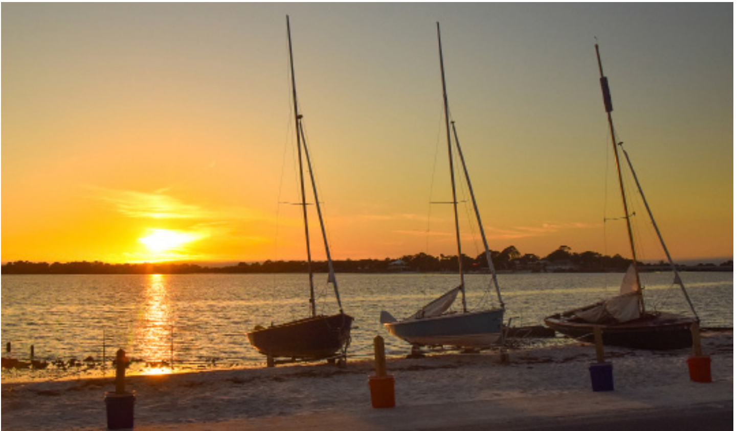
Wayfarers in silhouette at Cedar Key, Fla. Six sailors from North Carolina and Florida enjoyed sailing, sunsets, comradie at the Feb. 8-11 cruise.