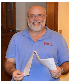
By Phil Leonard Fleet 15 Commodore W11137

Wayfarer Fleet 15 finished 2020 having successfully completed six out of the 10 planned regattas being counted towards the Fleet 15 annual trophy.